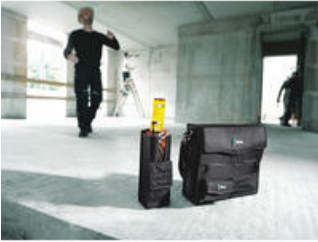
Wera 2go 7 high tool box.